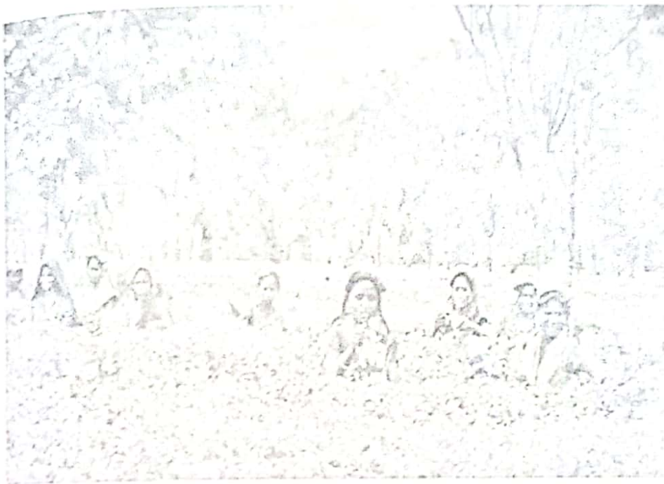
Tea Garden Worker Working in the Tea garden